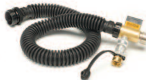
Constant Flow Air-Line Respirator