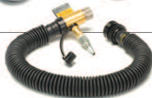
Duo-Twin Air-Line Respirator