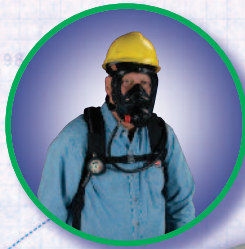
Airhawk® II Air Mask SCBA