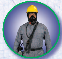
PremAire® Cadet Escape Respirator