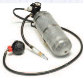
PremAire Cadet Escape Respirator