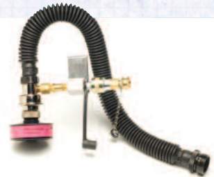
Duo-Flow Constant Flow Air-Line Respirator