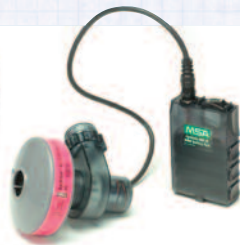
OptimAir MM2K Powered Air-Purifying Respirator