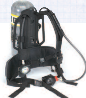
AirHawk® II Air Mask SCBA