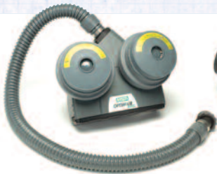
OptimAir TL Powered Air-Purifying Respirator