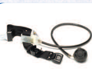
PremAire Cadet Pressure-Demand Supplied-Air Respirator