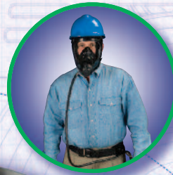
PremAire® Cadet Supplied-Air Respirator