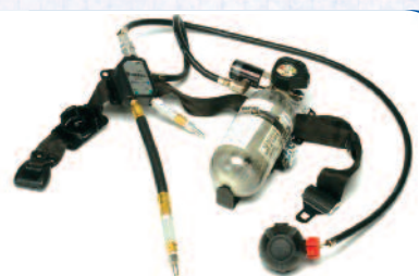
PremAire System with Escape Cylinder