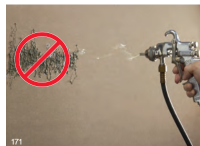
171 3M™ Cylinder Spray Adhesives do not atomize spray patterns with added airline. This means you get consistent even spray patterns, potentially saving rework and cleanup.