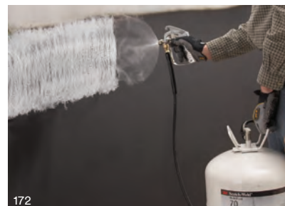
172 Consistent spray patterns and portable cylinders mean you can realize big improvements in efficiency and save time and labor costs.