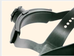
Easy-to-set, ratcheting headgear locking mechanism assures comfortable, secure fit.