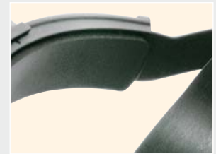
Comfortable cell foam on back of headgear.