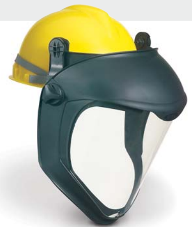
Hard Hat Adapter Accessory

*Face shield offers secondary protection and MUST be worn with spectacles or goggles.