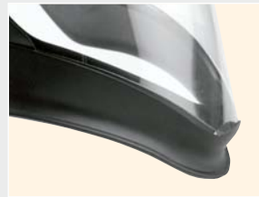
Shell offers built-in chin protection and extended top-of-head coverage.