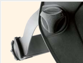
Highly adjustable headgear tilts visor nearer or farther from face depending on preference and application.