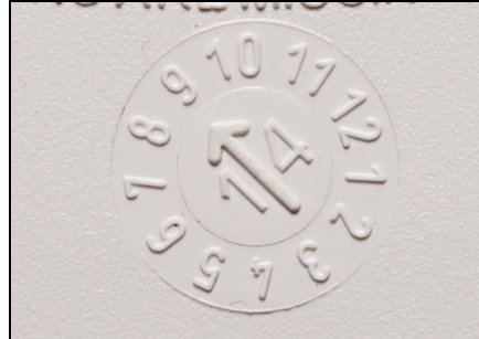
Shell Mold Date - Month and Year Located on Underside of Helmet Brim

MSA Corporate Center 1000 Cranberry Woods Drive Cranberry Township, PA 16066 800.MSA.2222 www.MSAafety.com